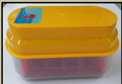
Model: EHE-12T R1895.00 Capacity :12 chicken/ 48 quail eggs Automatic egg turning, automatic humidity and temperature control

Automatic hobby incubators with smart technologies designed to hatch a wide range of poultry eggs which include quail, chicken, pheasant, duck, goose and swan. Suitable for hobbyists and enthusiasts.