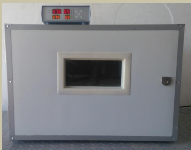
Model: EHE-144 R7795.00 Capacity: 144 Chicken eggs Automatic egg turning, automatic humidity and temperature control