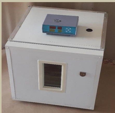
Model: EHE-100/ EHE 200 R7295.00 Parrot Brooder Automatic humidity and temperature control