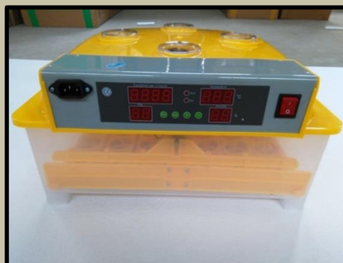
Model: EHE-48 R2995.00 Capacity :48 chicken eggs Automatic egg turning, automatic humidity and temperature control